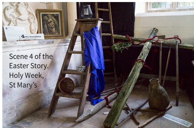
Scene 4 of the Easter Story. Holy Week, St Mary's