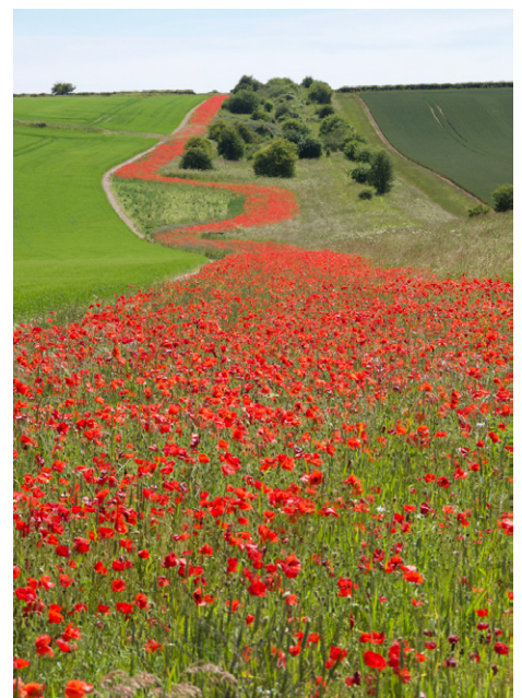
Poppies providing a wildlife field margin alongside Ackling Dyke Roman Road near Handley Cross roundabout (June 2019).

The beautiful spray of wild flowers I have outside on the vicarage lawn is far more beautiful than close cut striped grass. I have also been bringing the small vicarage pond back to life after last summer when the house was empty, and it nearly dried up. Now it's full of plant life, lovely insects and even some newts, plus a few fish.