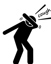
Cover Your Cough