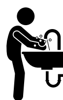
Wash Hands with Soap