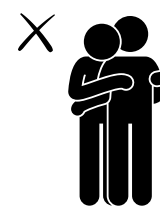
Avoid Close Contact